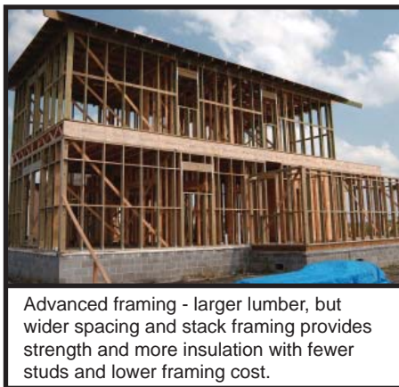
Advanced framing - larger lumber, but wider spacing and stack framing provides strength and more insulation with fewer studs and lower framing cost.